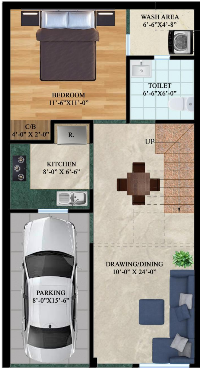
76 YD. DUPLEX VILLA GROUND FLOOR PLAN