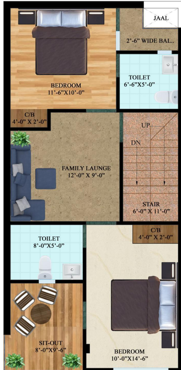
70 YD. DUPLEX VILLA FIRST FLOOR PLAN