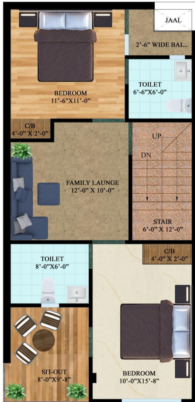
76 YD. DUPLEX VILLA FIRST FLOOR PLAN