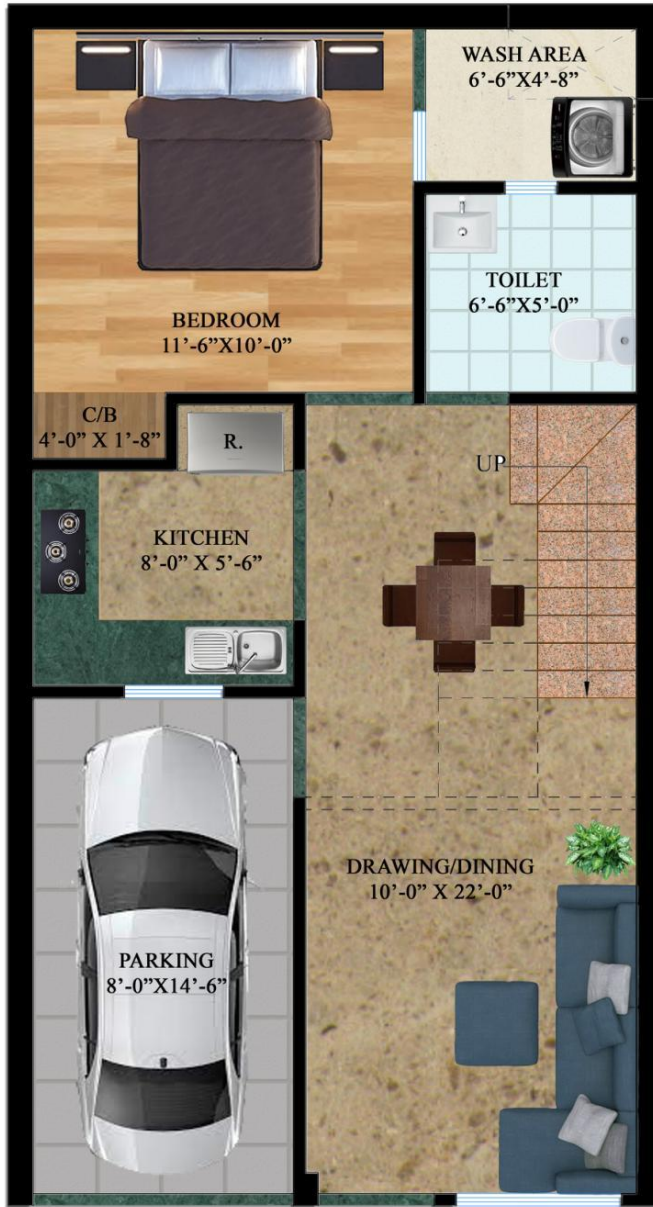
70 YD. DUPLEX VILLA GROUND FLOOR PLAN